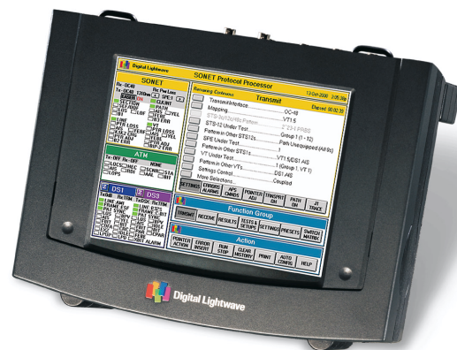
Network Information Computer (NIC ASA 312)

Combining innovative features, functionality and performance into a single cost-effective product, the NIC ASA 312 Network Information Computer is the most advanced testing platform available today.