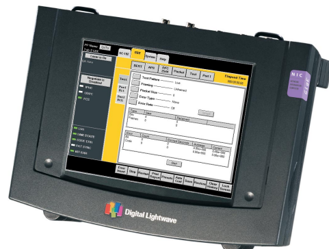
Network Information Computer (NIC GigE)

The NIC GigE is easy to use, with intuitive touch-sensitive GUI capabilities that allow technicians of any experience level to operate the unit. The NIC GigE is also fully interoperable with the entire NIC product line, providing a broad range of diagnostic capabilities.